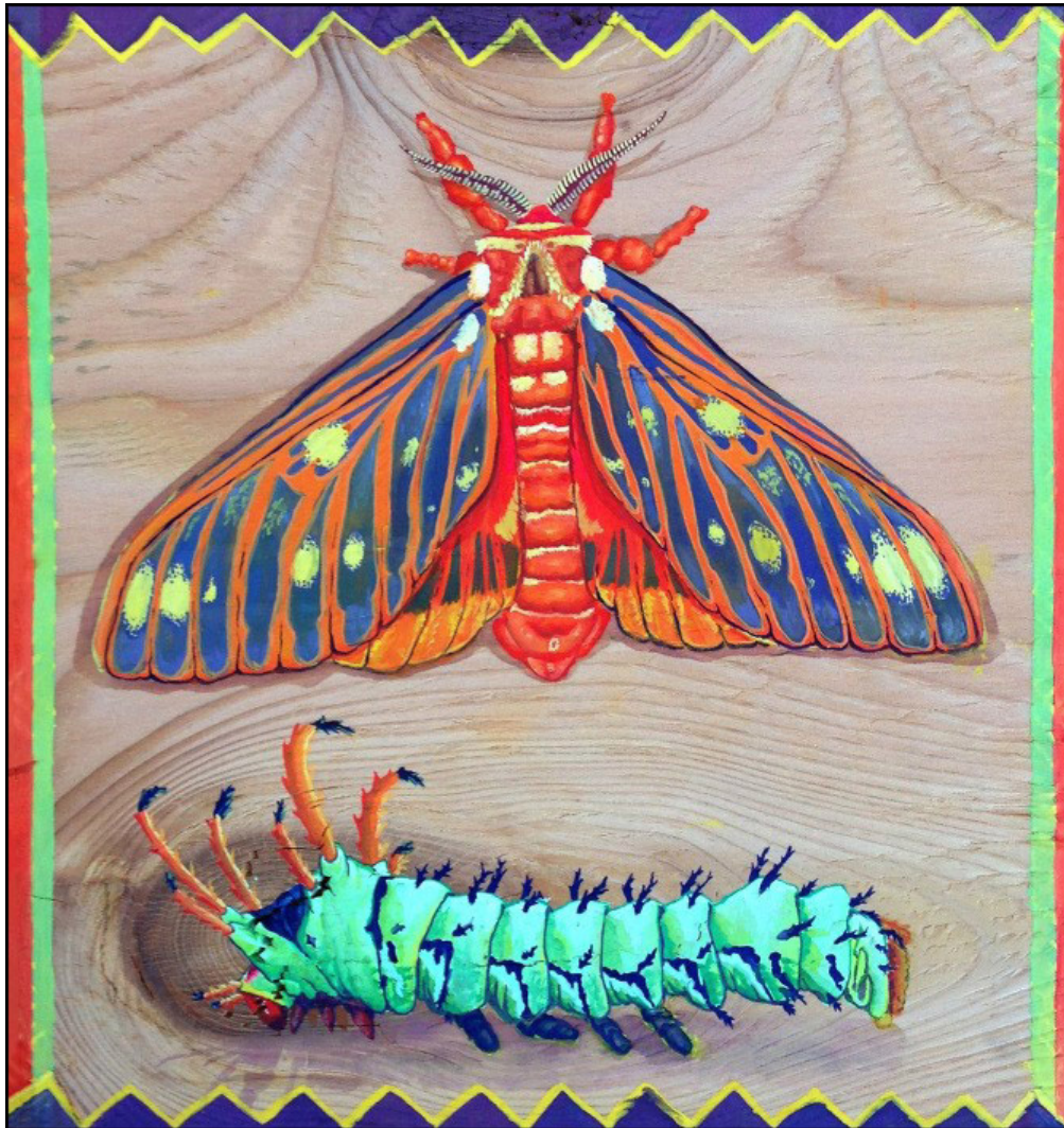
Royal Walnut Moth ( Citheronia regalis ), gouache on wood, by Yvonne C. Byers.